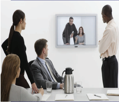
Video testimony pilot program